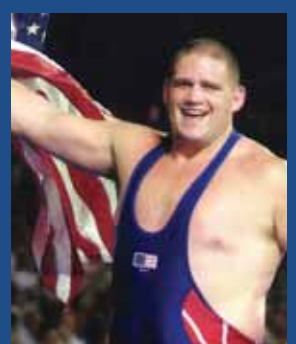
Rulon Gardner Olympic Wrestling Champion

His latest accomplishment is his book Never Stop Pushing , which was released in September 2005.