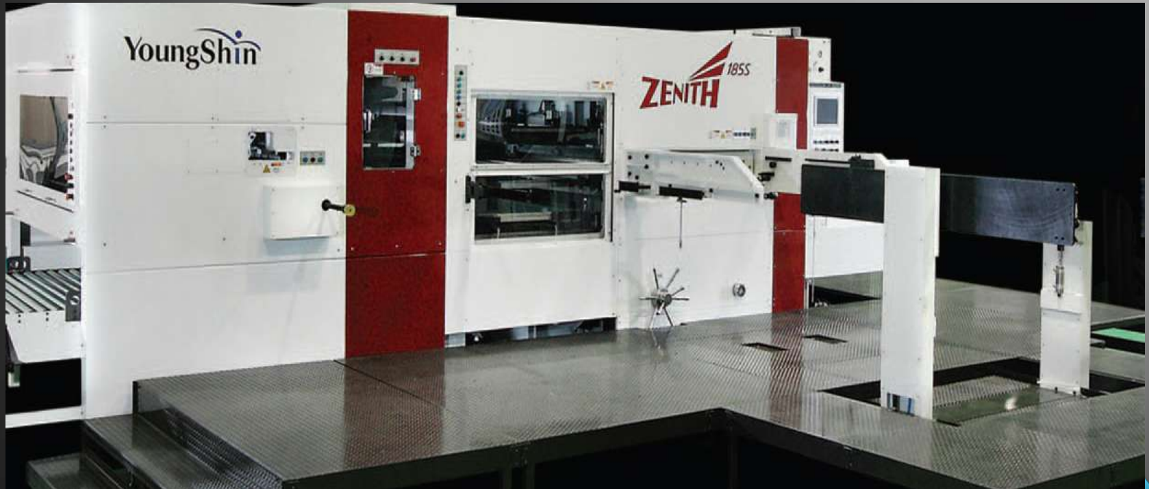
YOUNG SHIN ZENITH 1850